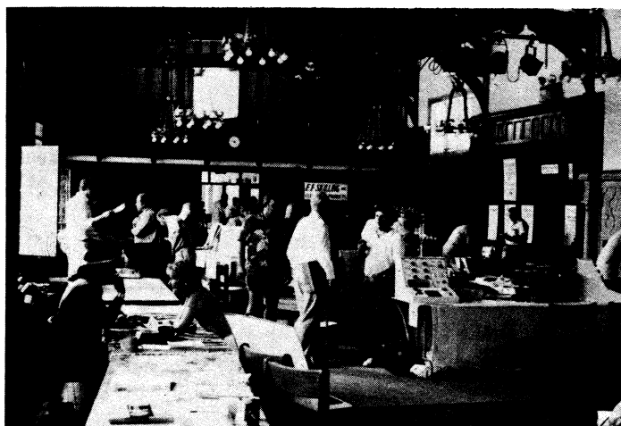
LOOK 'EM OVER!