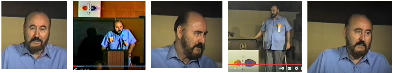
Tom Bearden Speaking At Some of the USPA Conferences

IMBD (The Internet Movie Data Base) offers a mini bio of Tom Bearden as follows: "Tom Bearden is a writer, known for Energy from the Vacuum (2006), Unacknowledged (2017) and PBS News Hour (1975)."